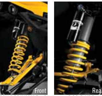
FOX PODIUM X Performance RC2.5 HPG piggyback shocks