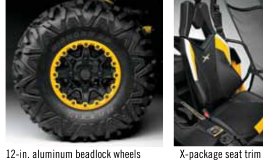
12-in. aluminum beadlock wheels